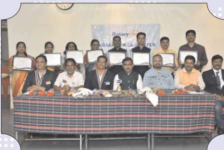
'Nation Builder Award Distribution'