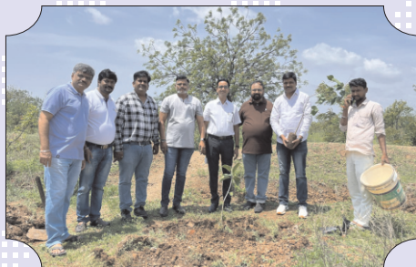
Tree Plantation at Gulwanchi Village