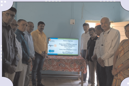
Digi class Installation done at RC Majalgaon central