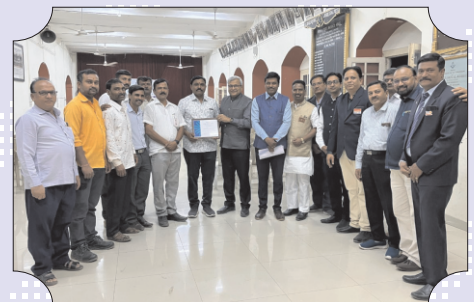
Digiclass installed at Beed