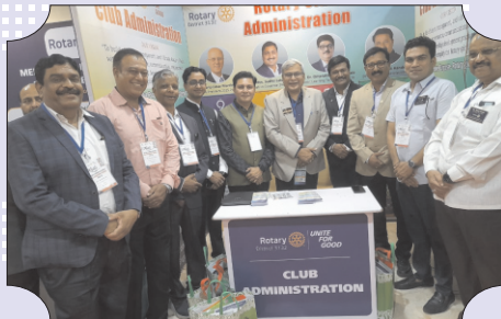
Attended Club Administration Event