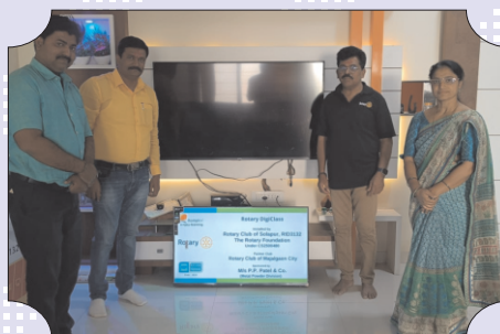
Digi class software installed at RC Majalgaon city, ZP School Mangrul no.1, Majalgaon.