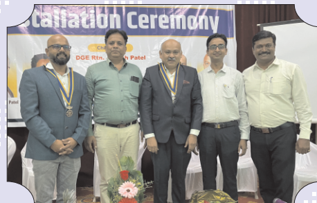
'Installation Ceremony Of Rotary Club Of Solapur North'