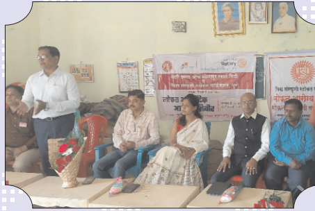
Health Checkup Camp