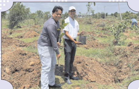
Tree Plantation at Gulwanchi Village