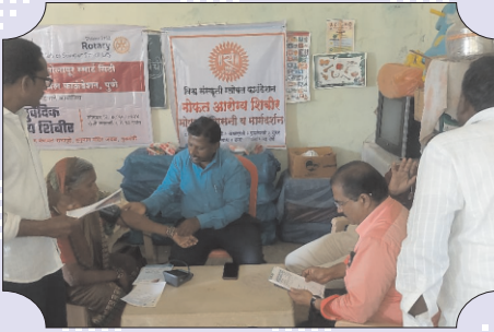
Health Checkup Camp