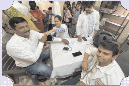
Health Checkup Camp