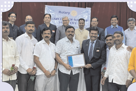
Digi class software installed at RC Ambejogai City, Someswar Girls highschool, Ghatnandur, Ambejogai.