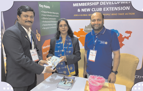
Membership Development Activity