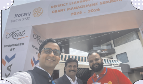
Attended Grant Management Seminar