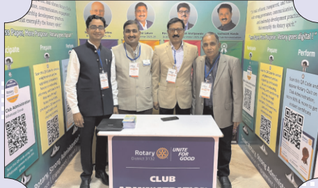
Attended Club Administration Event