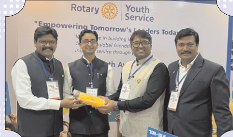
Attended Youth Service Function