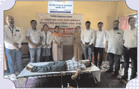
Health Checkup Camp