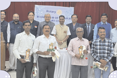
Vocational Awards Distribution