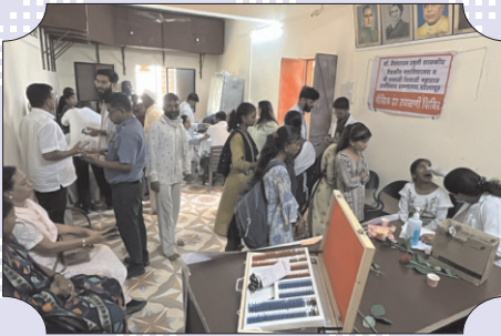
Health Checkup Camp