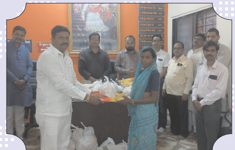
On Bhaubij Event 'Saree and Sweet' Distribution