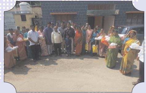
On Bhaubij Event 'Saree and Sweet' Distribution